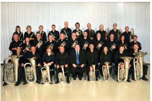
Brass Band, 30<sup>th</sup> April