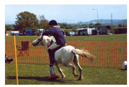
Gymkhana, 14<sup>th</sup> May