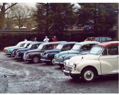
Morris Minor Rally, 15<sup>th</sup> May